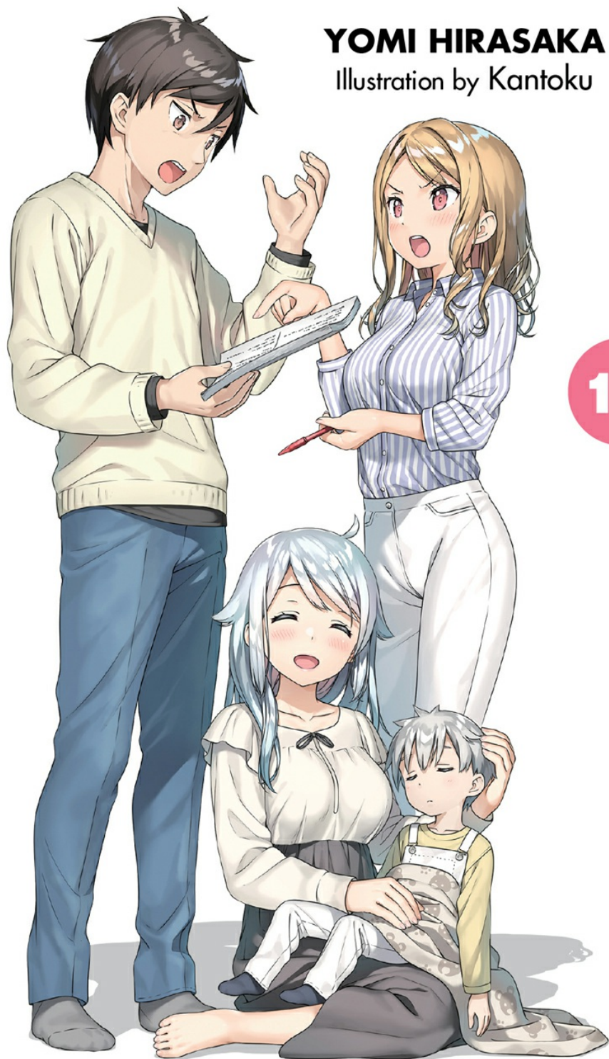
Illustration by Kantoku