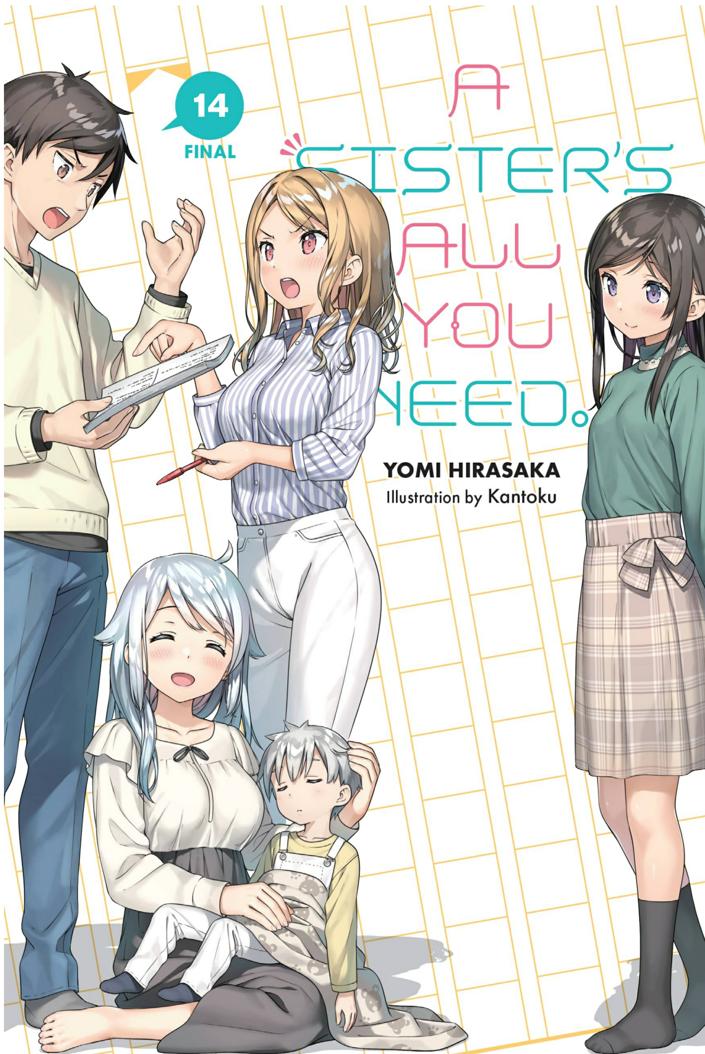
Illustration by Kantoku